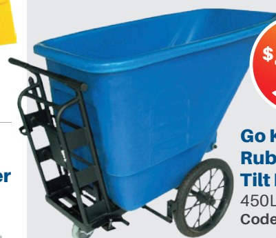
Go Kart Rubbish Tilt Bin 450L Code: GO KART