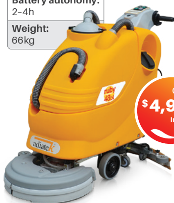
Adiatek Ruby 48bl Auto Scrubber Code: K0100401

Working capacity: 1700m 2 /h Cleaning width: 485mm Battery autonomy: 2-4h Weight: 66kg