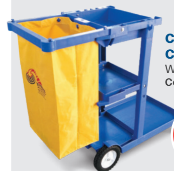
CCS Janitor Cart With Bag Code: JC

CCS Safety Cone Cleaning in Progress Code: SCC Caution Wet Floor Code: SCW