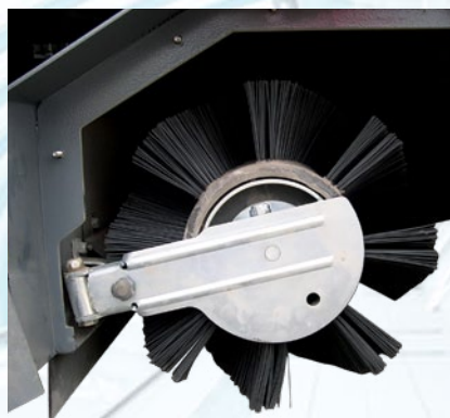
SLS System - Brush self-levelling system