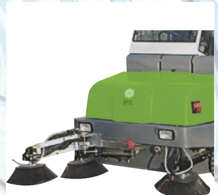
Third brush setup

Optional side brush cover for use in very dusty areas.