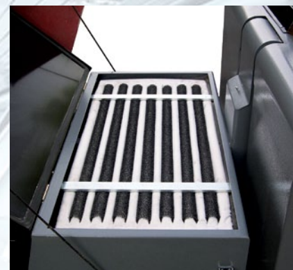
Pleated micro-fine polyester filter

A long spring enables the brush to adapt immediately to all surfaces. Once adjusted, the brush remains in that position until completely worn out.