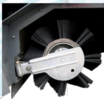
SLS System - Brush self-levelling system