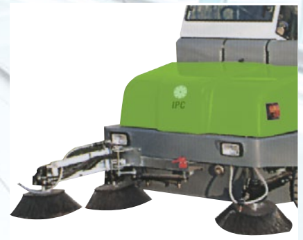
Third brush setup

Optional side brush cover for use in very dusty areas.