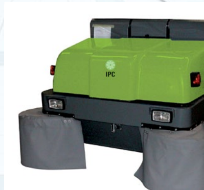
Fine dust setup

Hydraulic piston connected to the rear guide wheel.