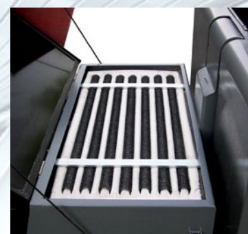
Pleated micro-fine polyester filter

A long spring enables the brush to adapt immediately to all surfaces. Once adjusted, the brush remains in that position until completely worn out.