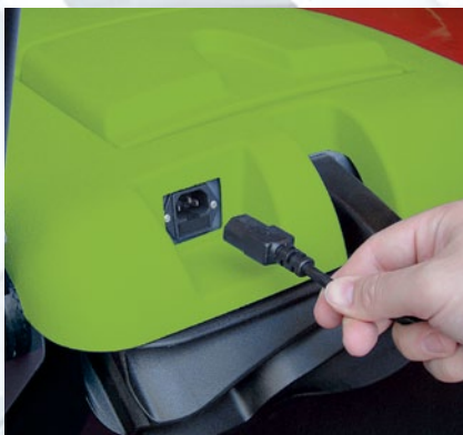
External battery charge plug Charging cable stowed on top cover.