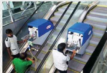
Rotomac ET15B - Automatic Escalator Deep Cleaning Machine