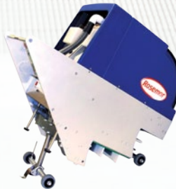
Modular travelator/escalator deep cleaning machines