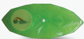
Cucumber Melon (Green) Code: BA2GM