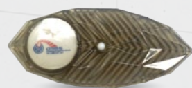
Paco Rabanne (Grey) Code: BA2PR