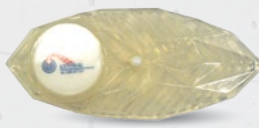
White Linen (Clear) Code: BA2WL